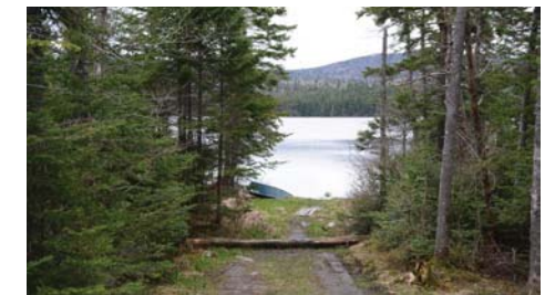
Informal water access on west shore of Little Diamond Pond