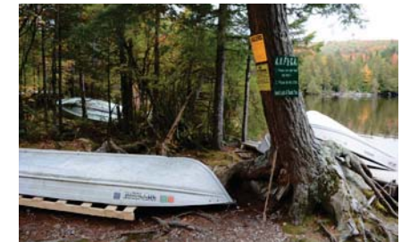
Boat Launch at Big Dummer Pond